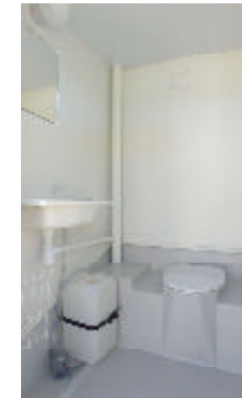
Waste tank model

The WC model has a water flush ceramic toilet bowl and a plastic washbasin.