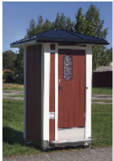
Classic ready for delivery to a main Swedish ski resort.