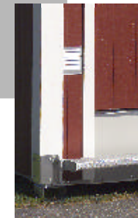
.. construction for easy shifting