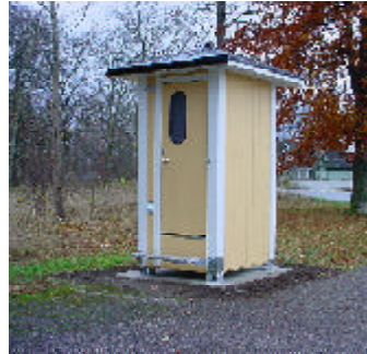
Classic, at bus drivers' service