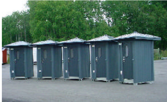
Classic ready for delivery to remote bus stops in Finland.